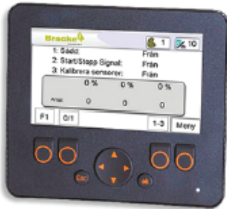
PLC-based control system.