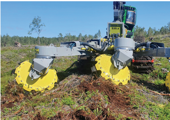
The Bracke S35.a can be attached to a one-, two-, or three-row scarifier.