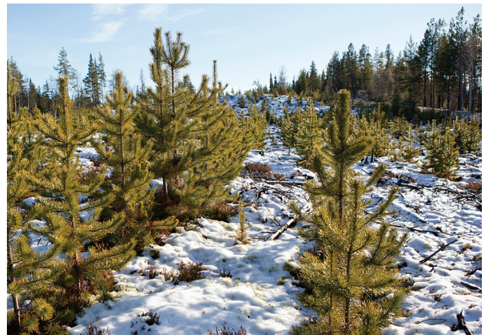
Very good production after scarification and sowing with the S35.a.