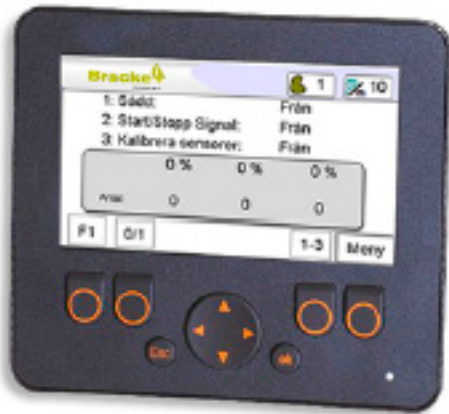
PLC-based control system.