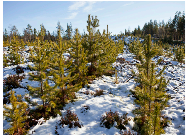
Very good production after scarification and sowing with the S35.a.