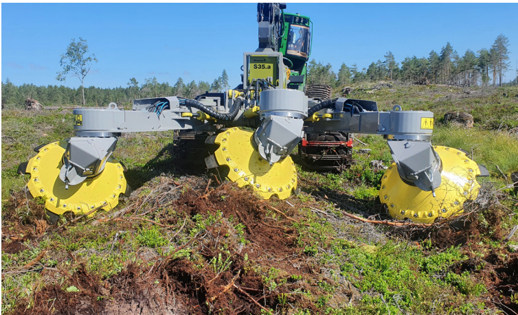
The Bracke S35.a can be attached to a one-, two-, or three-row scarifier.